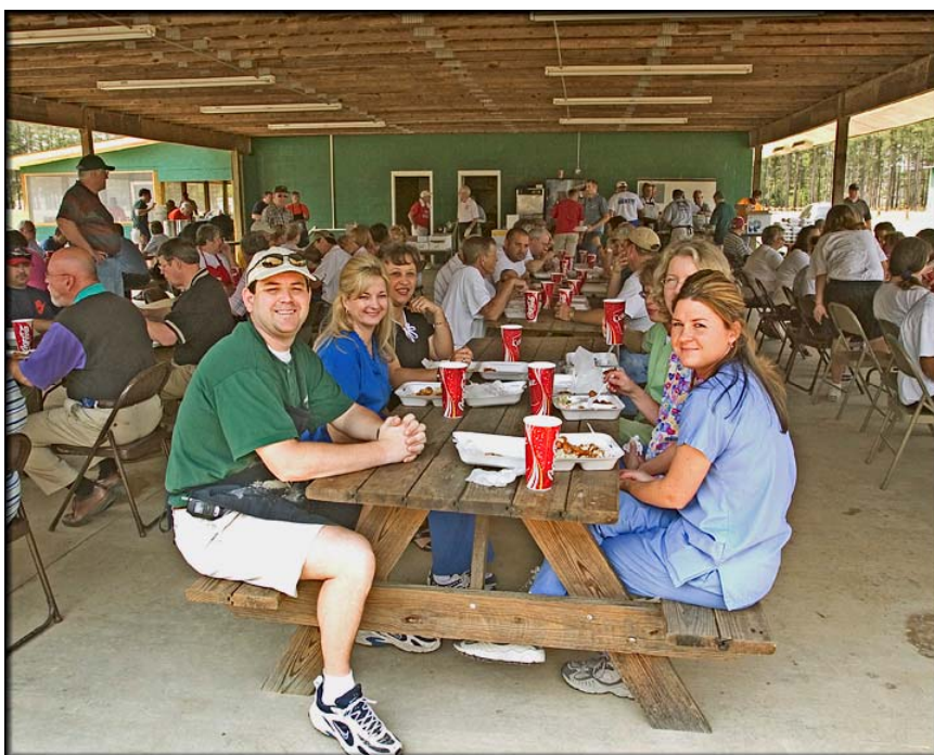
Pictured on the left are some members of our supportive community enjoying the fine food of the Annual Shrimp/Fish fry held May 11th, 2005.